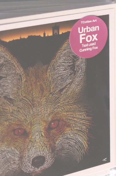
Tcottee Art Urban Fox Text used Cunning Fox