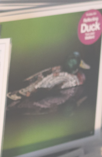
Tcottee Art Collecting Duck Text used Duck