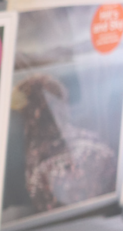
Tcottee Art It's not the duck Text used It's not the duck