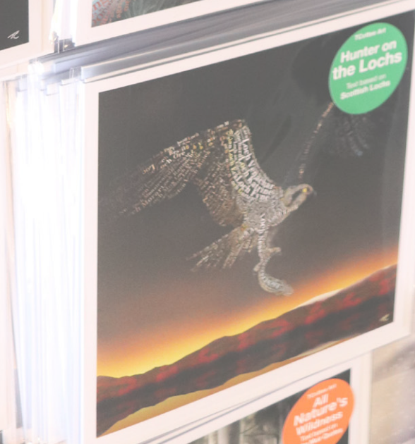
Tcottee Art Hunter on the Lochs Text based on Scottish Lochs