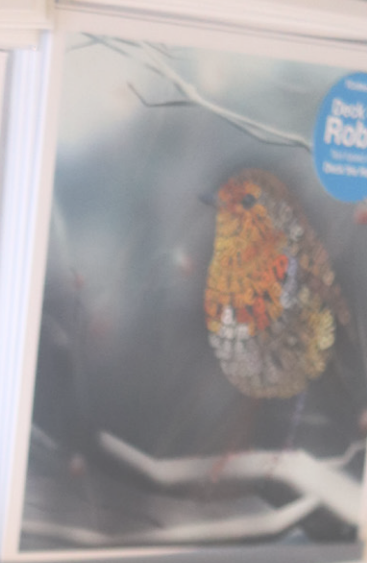
Tcottee Art Deck the Robin Text used Deck the Halls