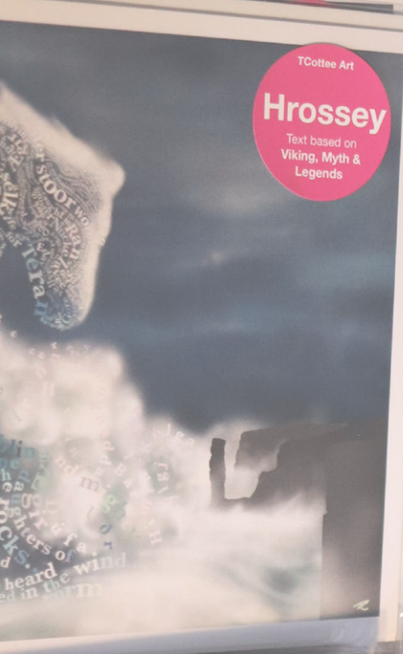
Tcottee Art Hrossey Text based on Viking, Myth & Legends