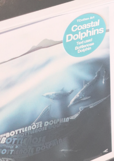
Tcottee Art Coastal Dolphins Text used Bottlenose Dolphin