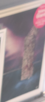
Tcottee Art It's not the crow Text used It's not the crow