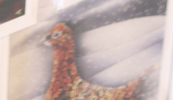
Tcottee Art All Nature's Wildness Text used All Nature's Wildness