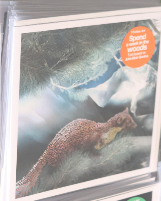
Tcottee Art Spend a week in the woods Text based on John Muir Quotes