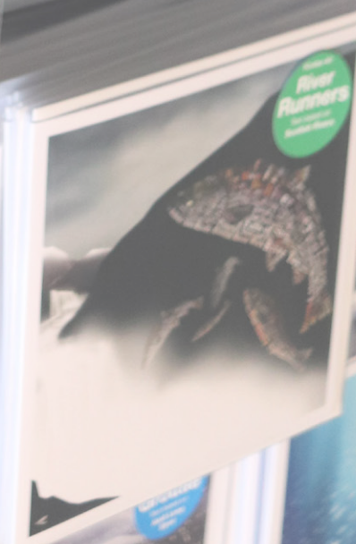
Tcottee Art River Runners Text used River Runners