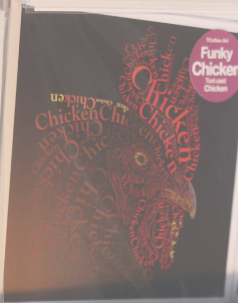
Tcottee Art Funky Chicken Text used Chicken